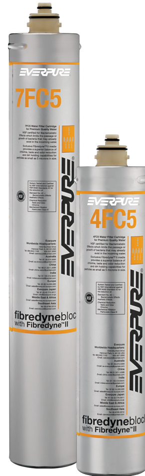
4FC5 Replacement Cartridge 1 PK: EV9693-21 7FC5 Replacement Cartridge 1 PK: EV9693-61

Always flush the filter cartridge at time of installation and cartridge change.