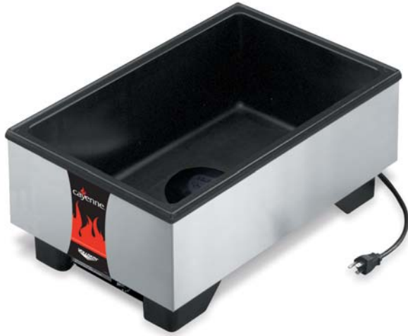
Cayenne® Model 1001 Full-Size Food Warmers