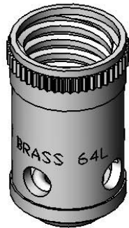
000788-20 Removable Eterna Insert, Hot Side