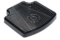
KIT, DRIP TRAY SINGLE SH