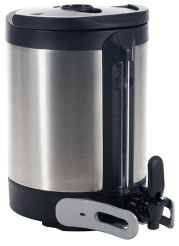
SH SERVER, 1.5G/5.7L INF SERIES